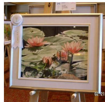
3rd Place: Lyla Couzens

their way to accommodate us in providing a classy venue, the use of their grand piano, decorative and scrumptious hors d'oeuvres, as well as wine and other beverages. By partnering with them,