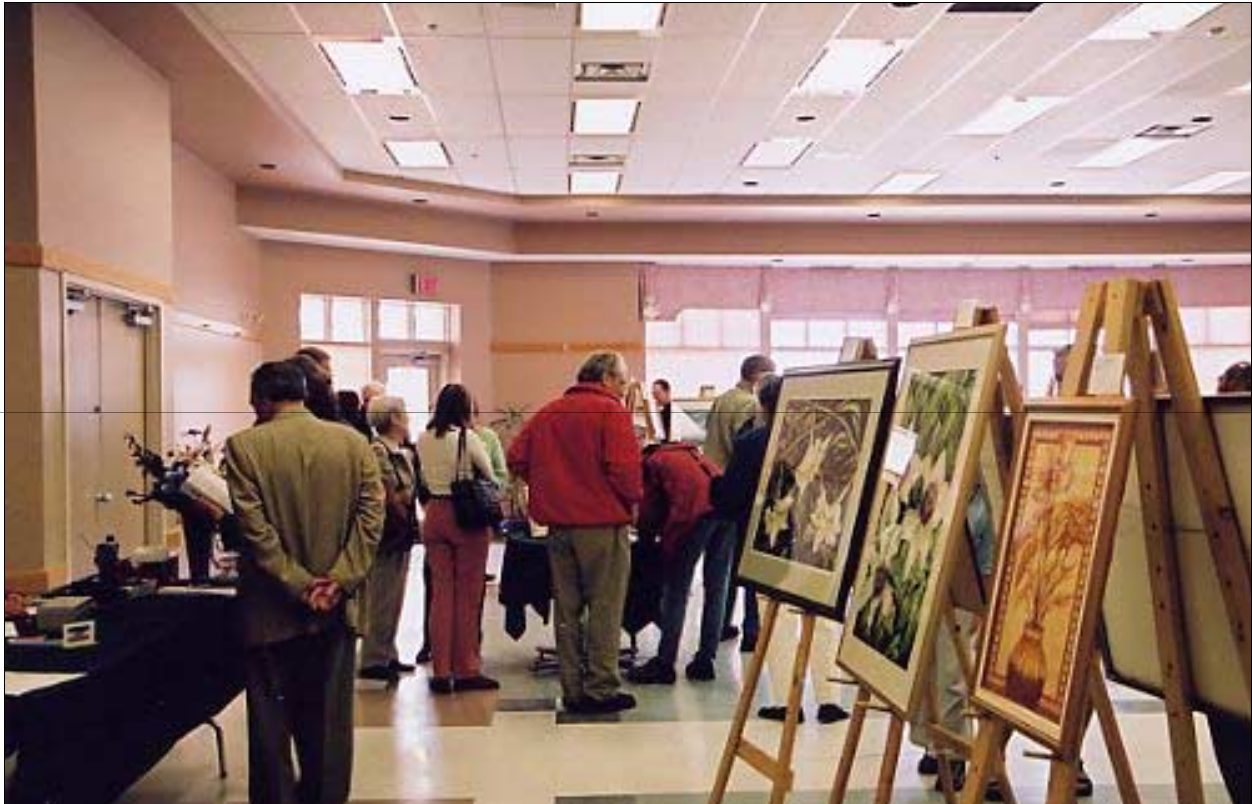
A snapshot taken at our FCA Calgary Chapter show "Art, At The Edge", held in the Edgemont Community Center - May, 2002.

Jury for Active Status will be held at Lakeview community Hall on Tuesday, October 15/02 at 6:30 pm sharp ! Please see pg. 6 for details